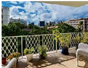
PRESTIGIOUS ELIOT HOUSE CONDO