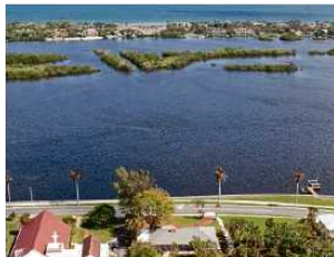
SOUTH FLAGLER DRIVE WATERFRONT