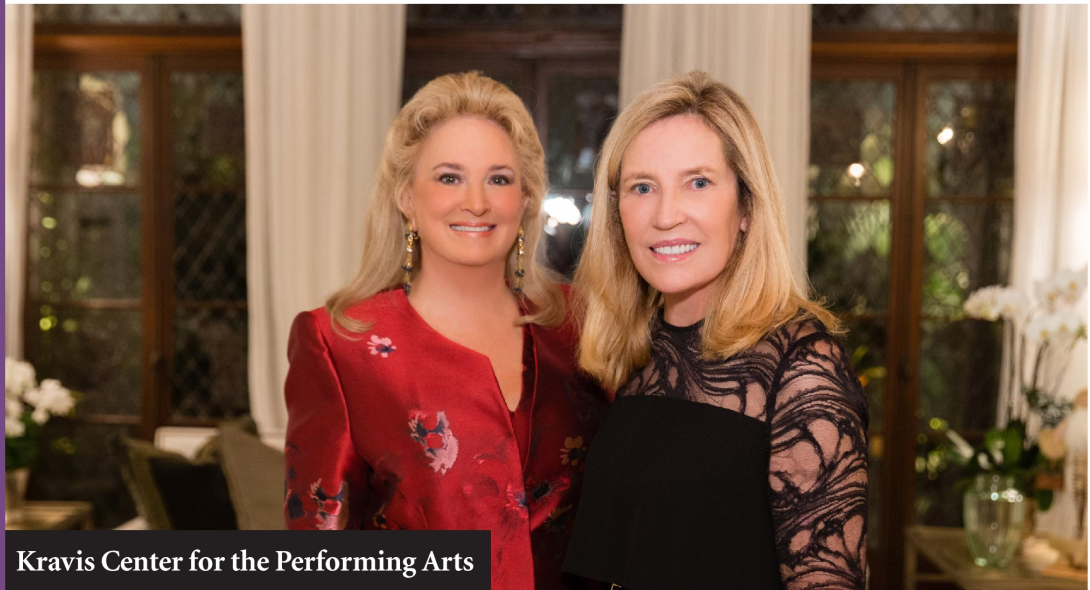
Kravis Center for the Performing Arts

Society Scene is now published on Wednesdays