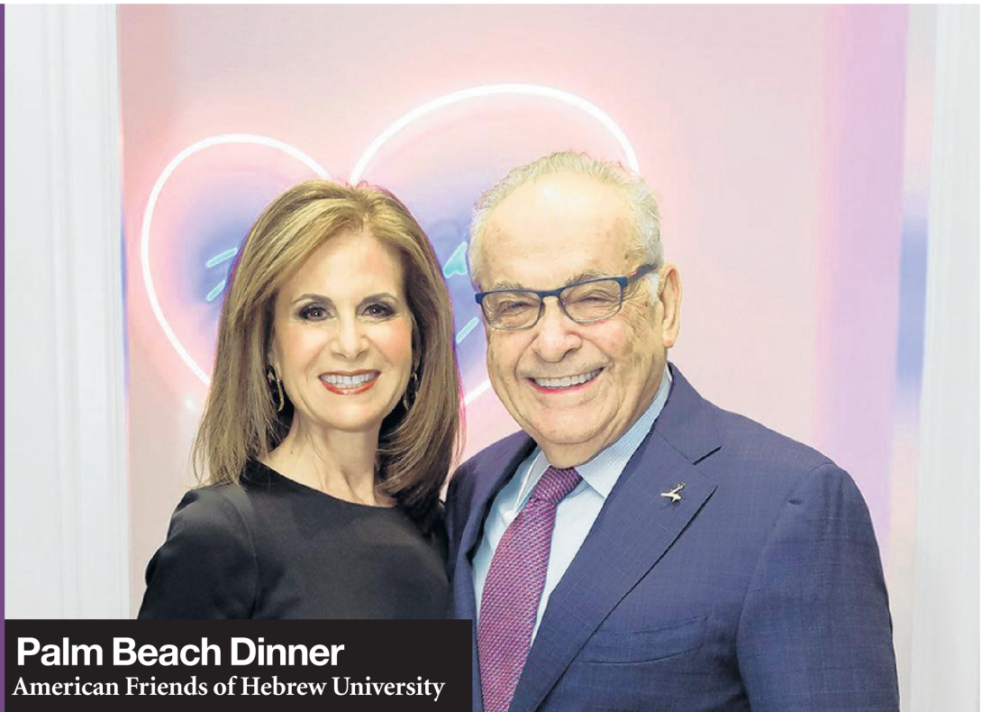
Palm Beach Dinner American Friends of Hebrew University