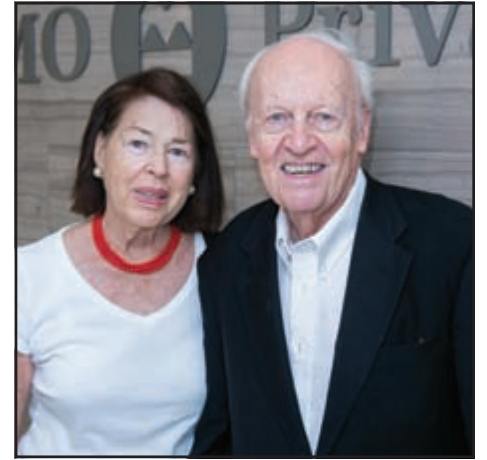
Carol and Ralph Hinkley