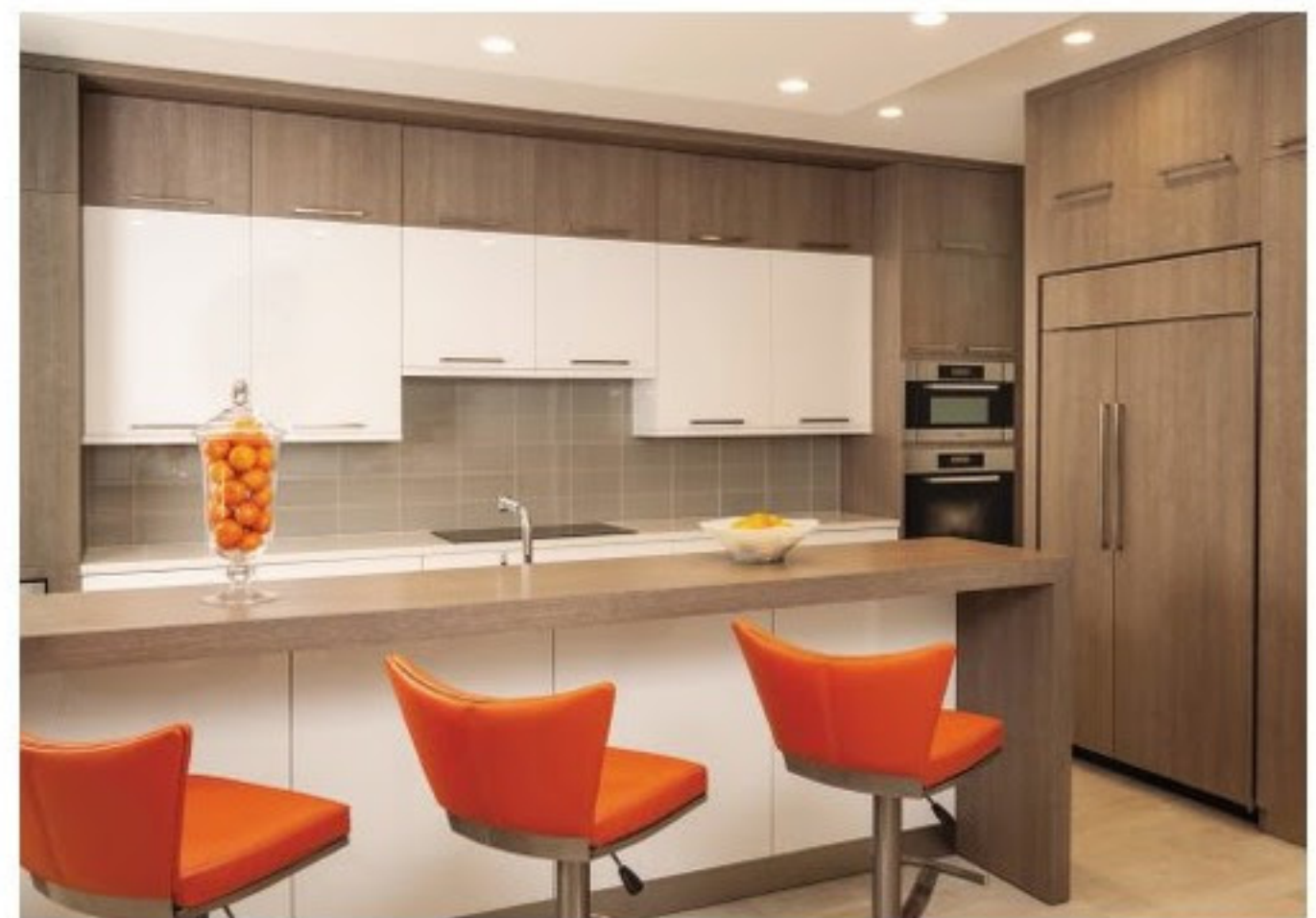
A free-standing island finished in white acrylic and textured wood grain laminate with vibrant orange bar stools is the center piece of the kitchen.

With the last child off to college, the Smiths decided it was time for a change. “We found ourselves with this big house and just the two of us,” Lennie says. “It didn’t make any sense. We travel a lot, and with the townhome, we can just lock the doors and leave.”