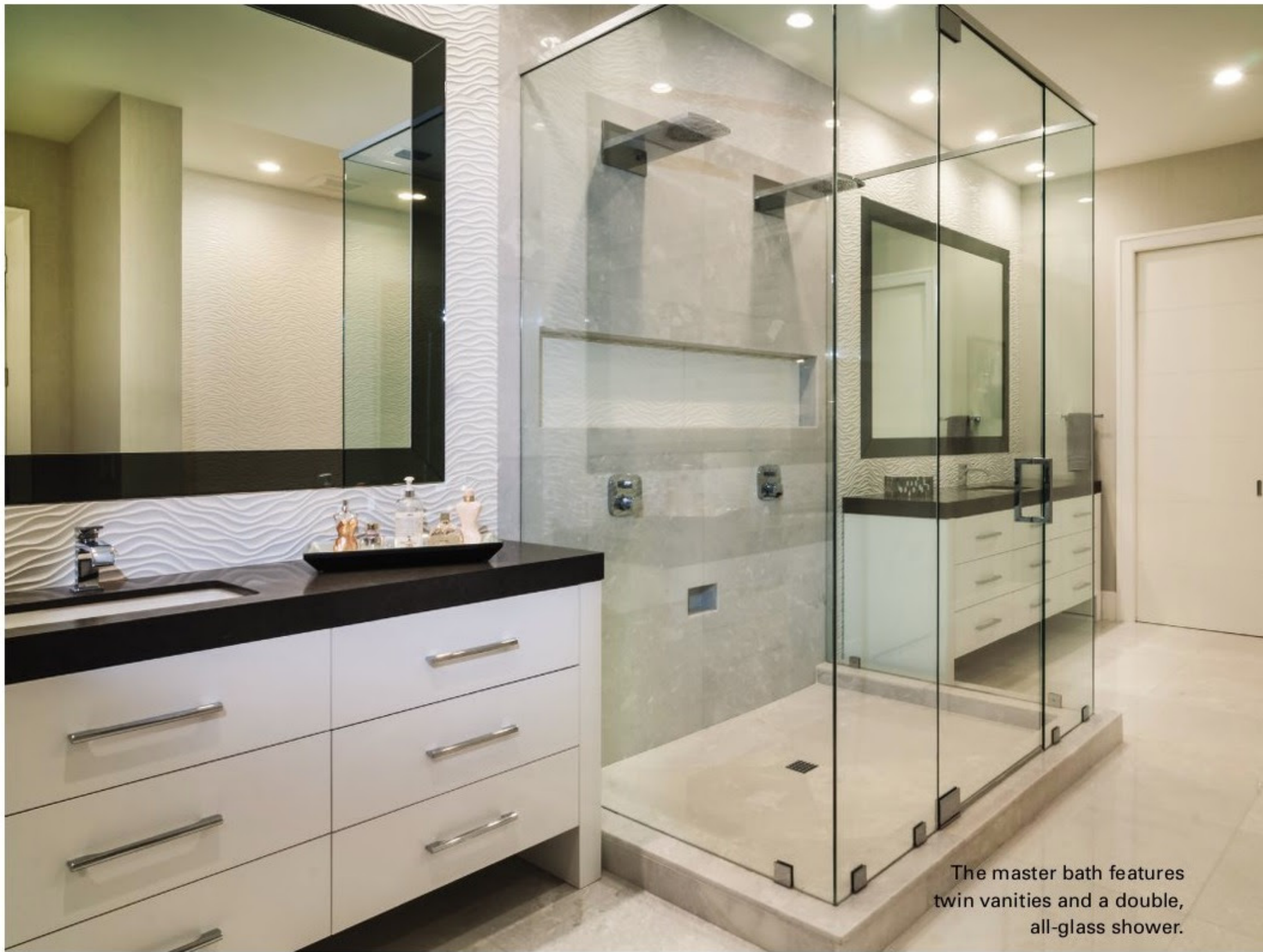
The master bath features twin vanities and a double, all-glass shower.

with wood ledges and linear textured wall covering the backs. “They didn’t want any remnants of the old design,” Connor says.