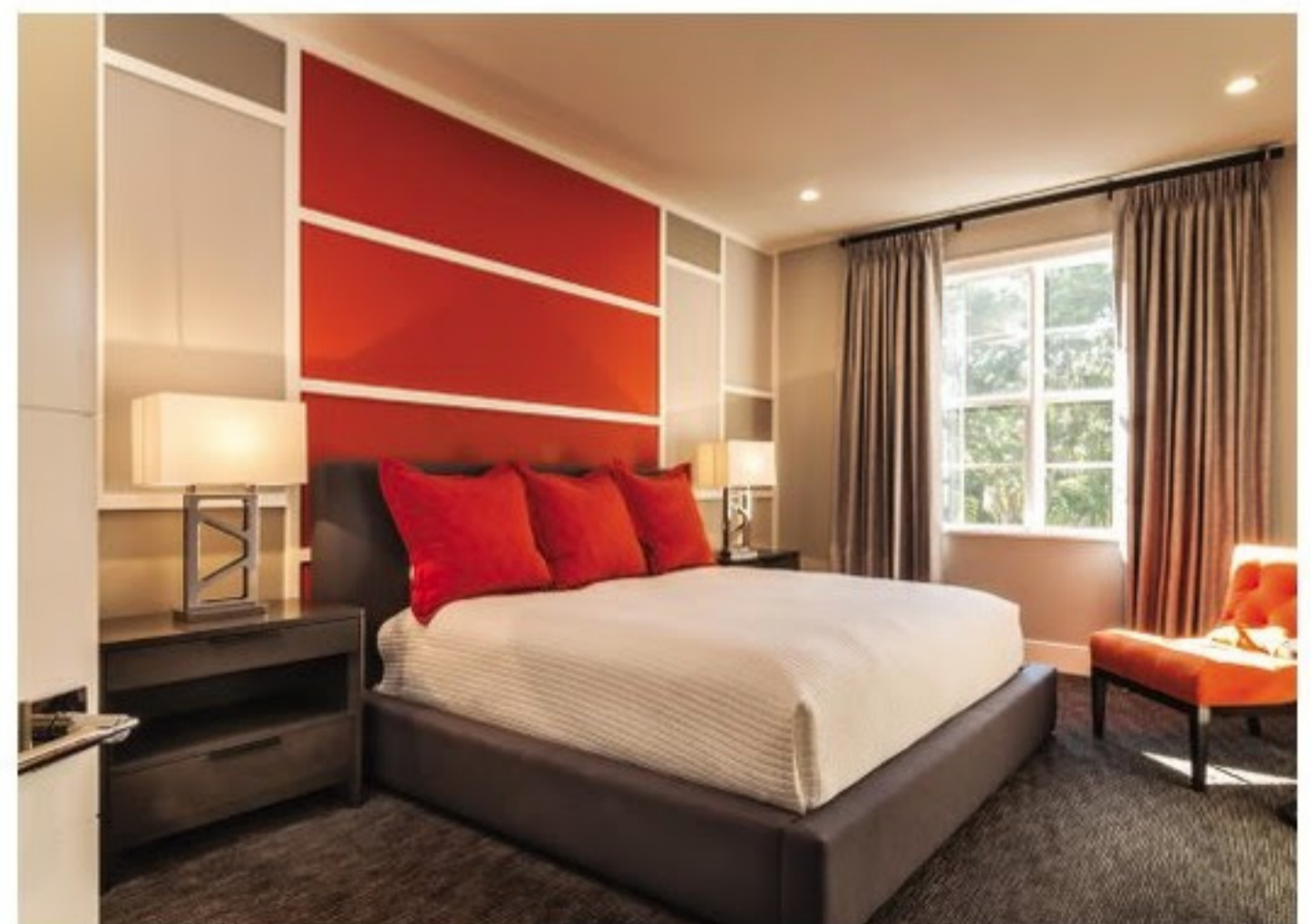
Orange painted panels create a playful feel in the guest room.

Adjacent to the kitchen is the dining area, which features a rectangular, live-edge oak table with highly polished stainless legs. Eight clean-lined, comfortable chairs are upholstered in soft gray linen. Above the table is a simple yet dramatic light fixture with multiple pendants. The Smiths are avid sailors, and on the dining room wall hangs a large framed photograph of a scene from the World Cup race. A soffit above houses multiple recessed light fixtures that illuminate the artwork.