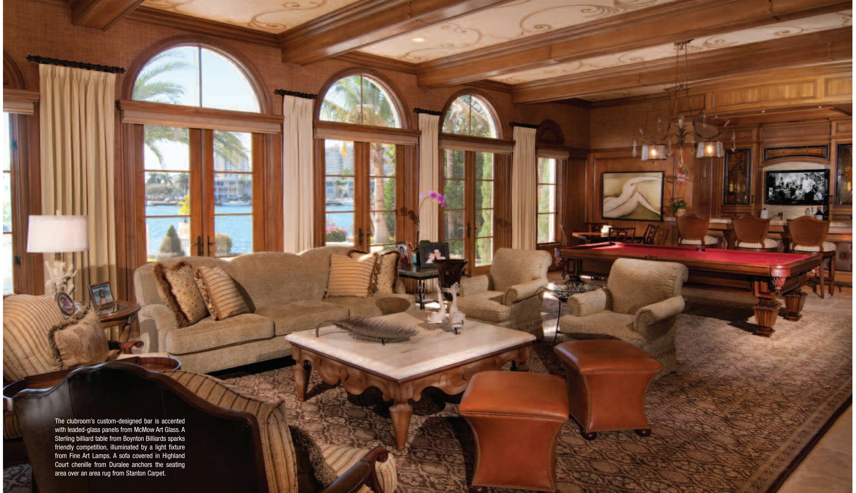
The clubroom's custom-designed bar is accented with leaded-glass panels from McMow Art Glass. A Sterling billiard table from Boynton Billiards sparks friendly competition, illuminated by a light fixture from Fine Art Lamps. A sofa covered in Highland Court chenille from Duralee anchors the seating area over an area rug from Stanton Carpet.

WHEN IT'S LOVE, YOU JUST KNOW. THAT WAS THE CASE when the lady of this particular house met her husband; she knew from their first date that she would marry him. The same happened when she first laid eyes on this magnificent Fort Lauderdale, Fla., property overlooking Sunrise Bay. And although at the time, only a third of a structure stood upon it and the lawn was overgrown, she saw its potential and fell head over heels. Despite her husband declaring her "a bit crazy" (they'd nearly completed the final work on their current residence several blocks away), she simply knew she had to live there.