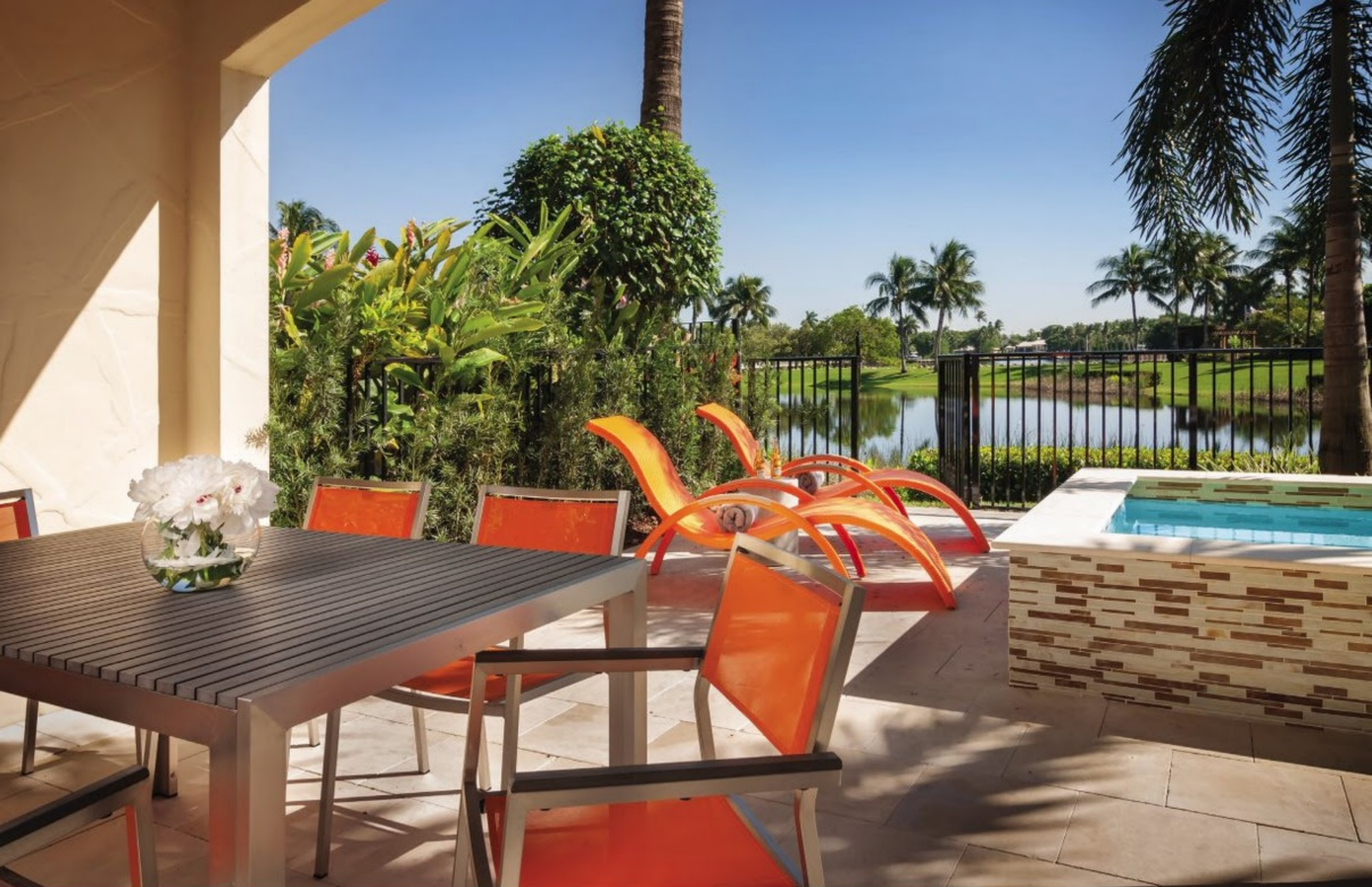
Outdoor dining and lounge areas offer a place to relax and enjoy the view.