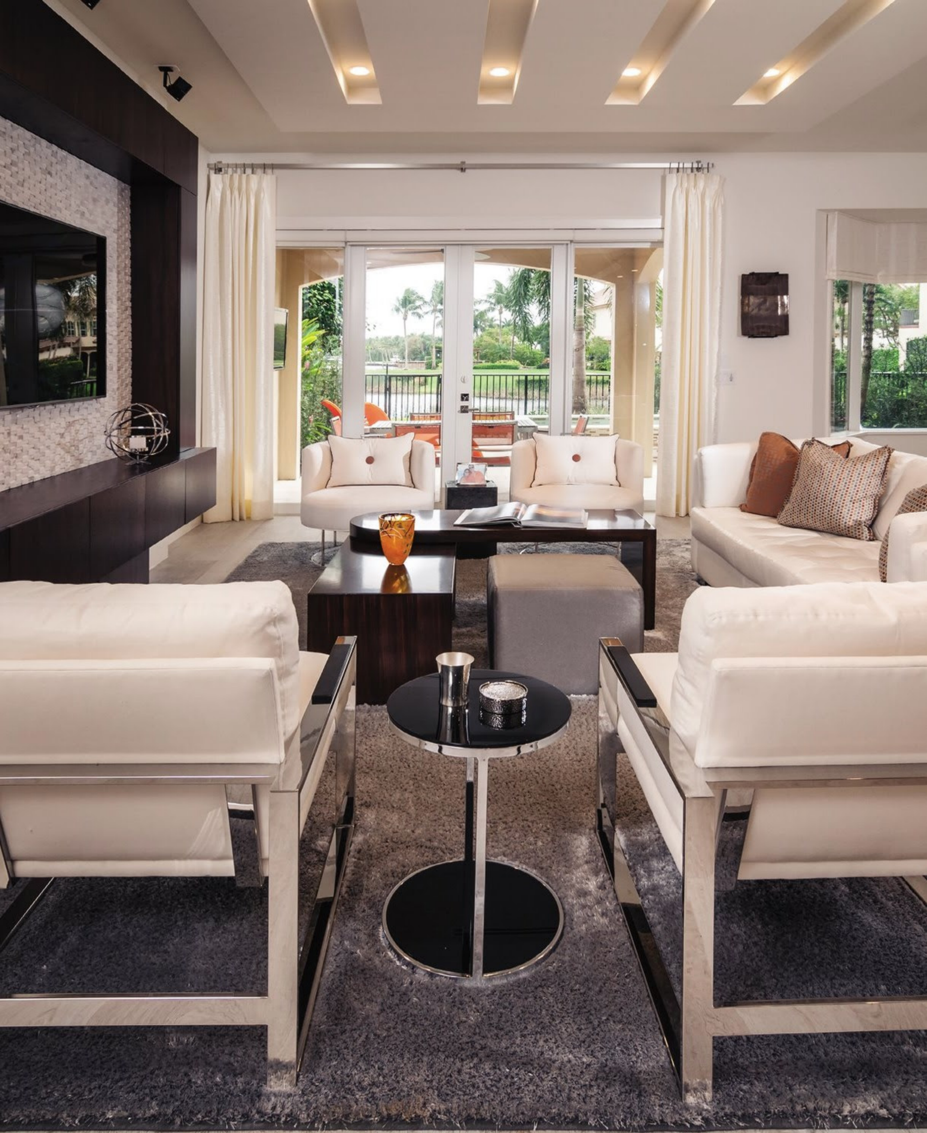
The open living area incorporates artful lighting and soffits to highlight different spaces and add architectural interest.