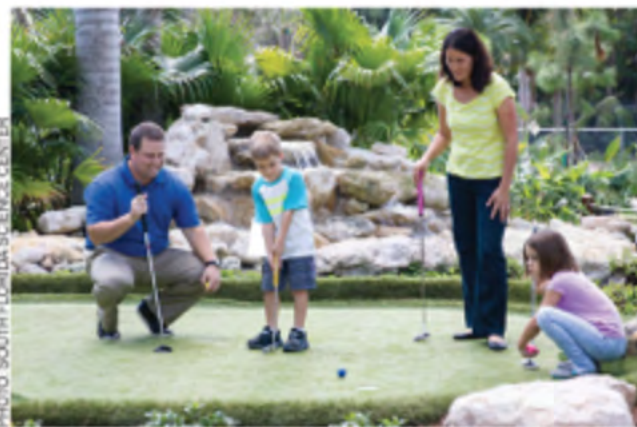
Families enjoy the Conservation Course, an 18-hole miniature golf course situated among a butterfly garden, koi pond and water features

The Science Center is currently home to the blockbuster exhibit, Our Body :