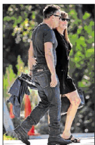
Bruce Springsteen and his wife, Patti Scialfa, leave the Royal Poinciana Chapel in Palm Beach after a memorial service for Clarence Clemens in 2011.

Springsteen wrote that "the morning sun laid a pinkish veil over the St. Mary's parking lot" as friends, family and E Street band members Max Weinberg and Garry Tallent arrived to see Clemens one last time. They stood beside his bed and Springsteen said he "strummed my guitar gently to 'Lands of the Living' Dreams" as Clemens passed.