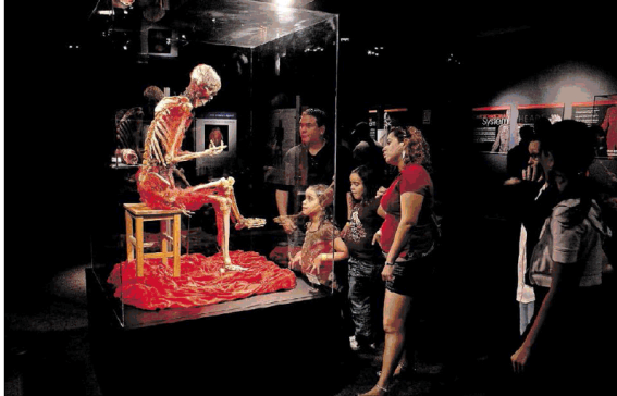
The human body can be explored, in intricate detail, starting this weekend at the "Our Bodies: The Universe Within" exhibition at South Florida Science Center and Aquarium.