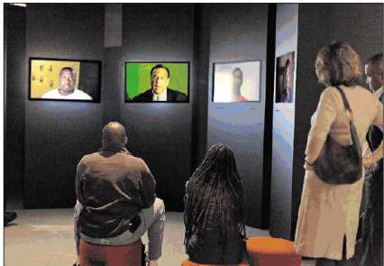
The traveling multimedia art exhibition, "Question Bridge: Black Males," can be seen now at the Norton Museum of Art in West Palm Beach.

Despite losing press coverage to her spotlight-stealing grandchildren and great-grandchildren – just kidding, Charlotte and George, you're adorable – the fact remains that Queen Elizabeth II has reigned over the U.K. for nearly 65 years. In that time, she's been served by a dozen prime ministers from Winston Churchill to "Iron Lady" Margaret Thatcher. Their conversations and private meetings are detailed in fictional form in a play titled "The Audience," which opens this weekend at Maltz Jupiter Theatre. "The Audience:" Runs through Nov. 6. Tickets start at $56. Maltz Jupiter Theatre, 1001 East Indiantown Road, Jupiter. Information: 561-575-2223; www.jupitertheatre.org